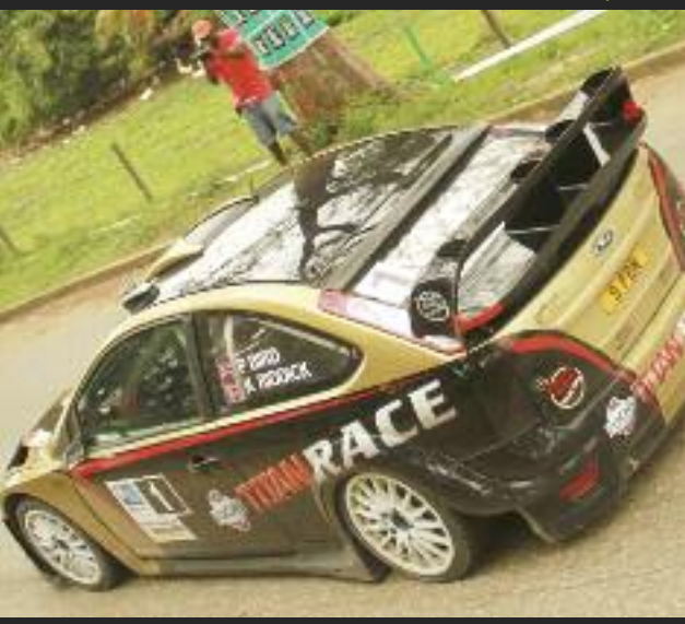
Bird's WRC Focus at Duckpo