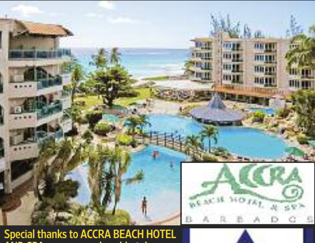
AND SPA –www.accrabeachhotel.com and Intercontinental Shipping Company Limited for their assistance during Rally